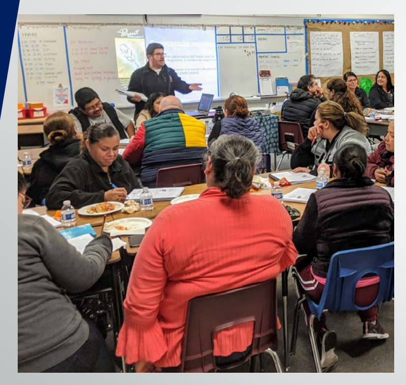
The Parent Project