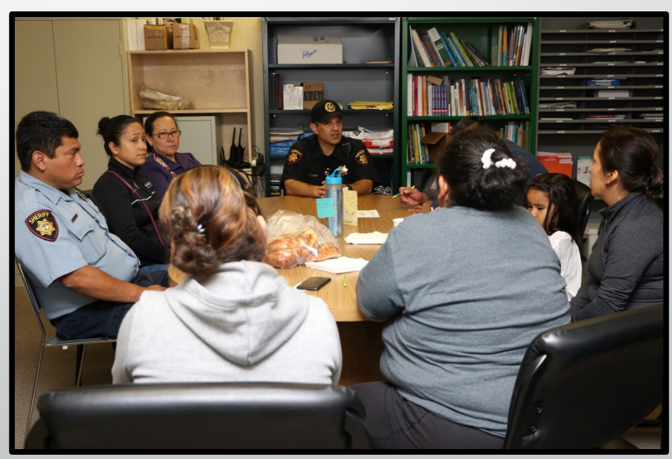
Donuts with Deputies