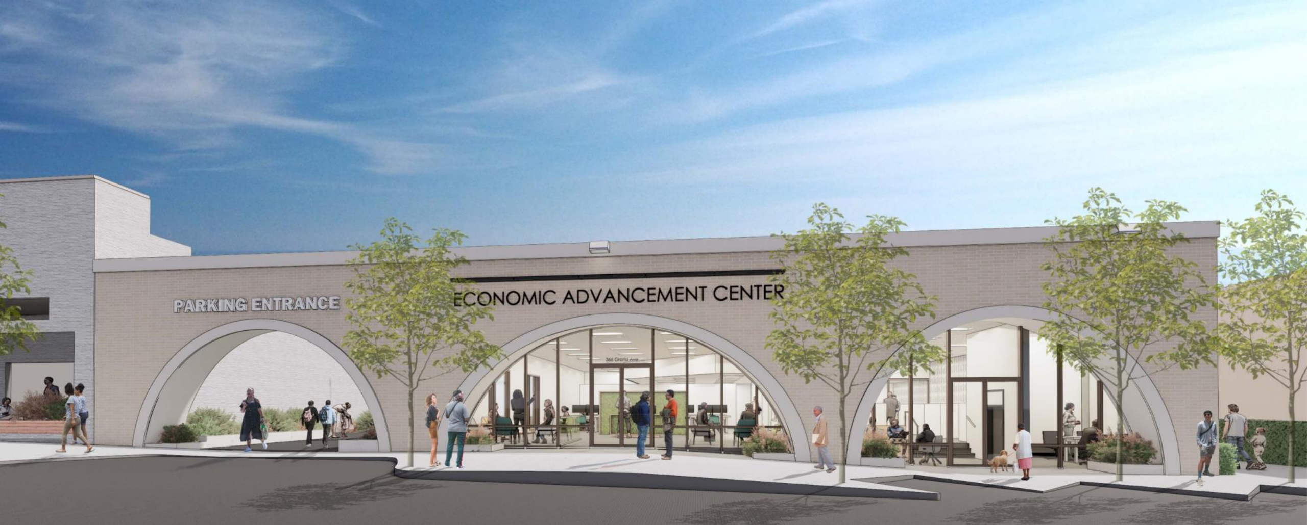
South San Francisco Economic Advancement Center