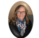
Dana Dahl Beach House Hotel