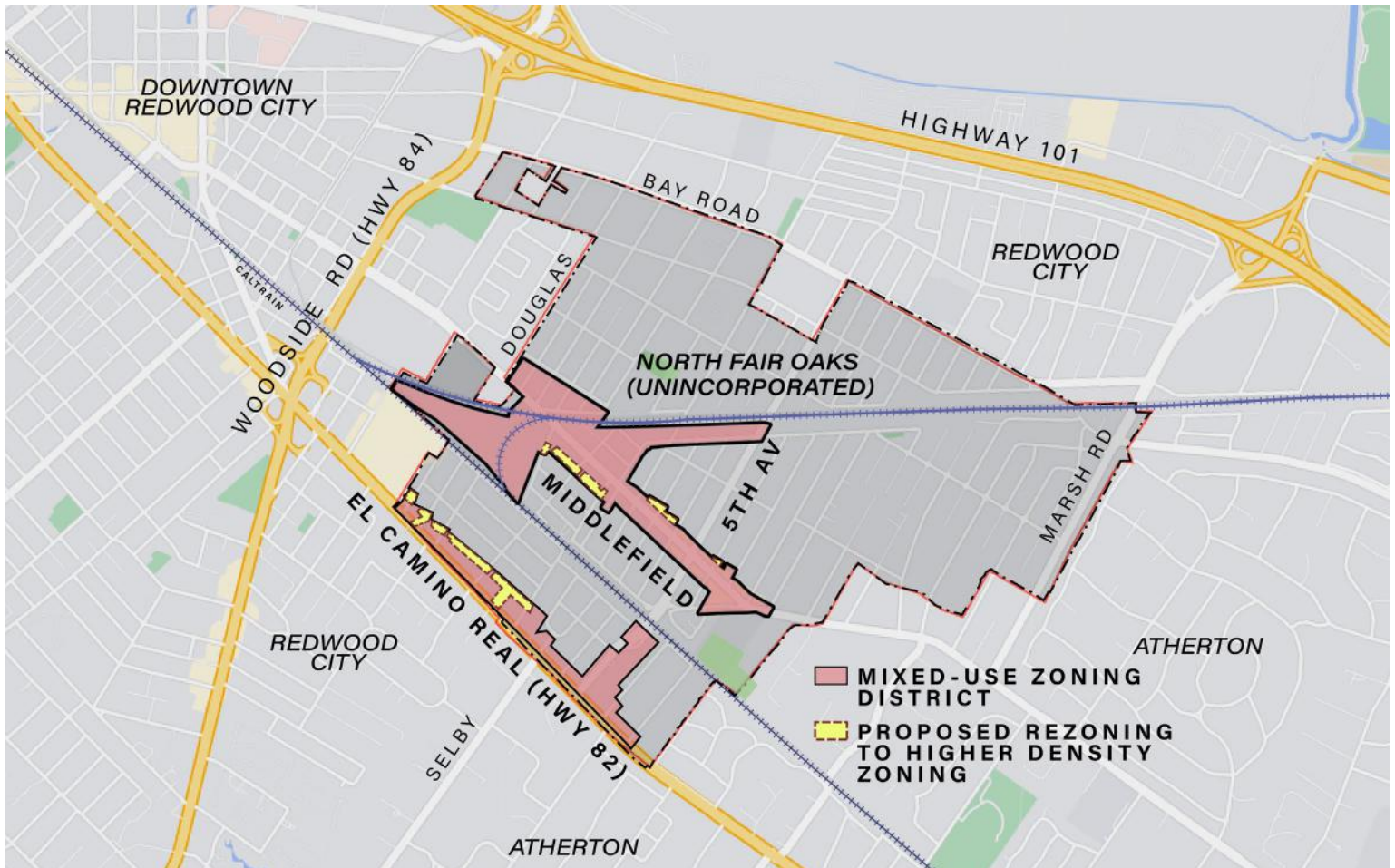
Location of Rezoning and General Plan Amendment Project Area within North Fair Oaks

Zoning is the regulations that establish what may be built on any specific property. Zoning defines the allowed use of structures (commercial, residential, recreational, or other uses), the allowed height and size of buildings, where a building may be located on a property, and sometimes the shape and design of the building, as well as other standards. In North Fair Oaks, the zoning regulations are intended to implement the broader land use and development goals and policies of the North Fair Oaks Community Plan, adopted in 2011, which establishes the community's vision for the long-term development of North Fair Oaks.