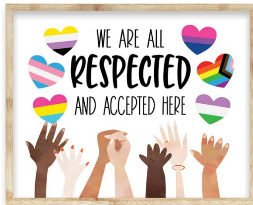
GSA poster ideas