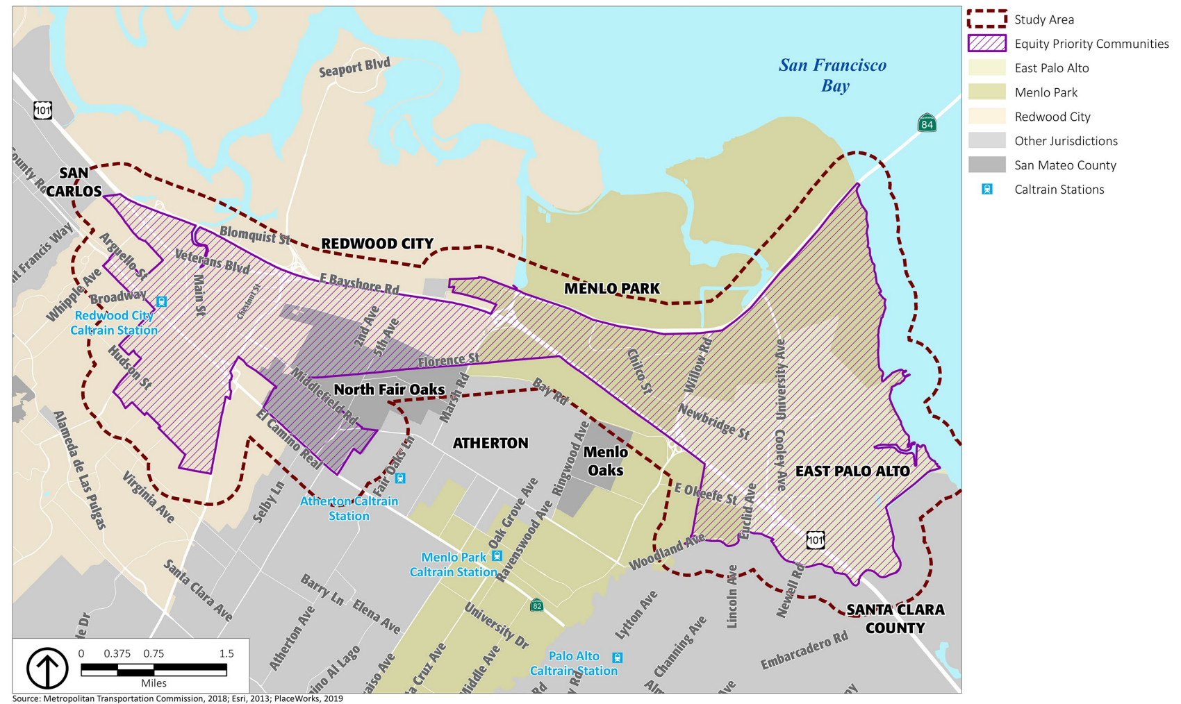
2023: EPCs span four jurisdictions