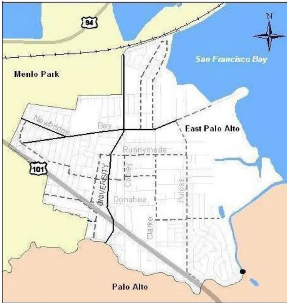
2004: Single East Palo Alto COC