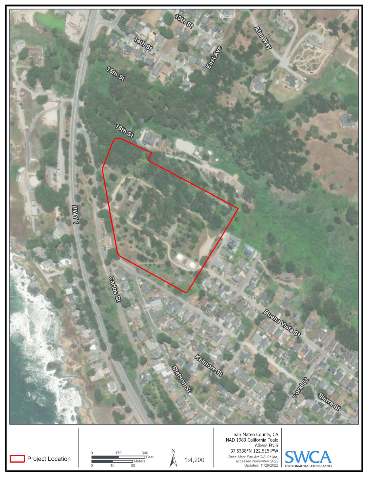
Figure 2. Project Location