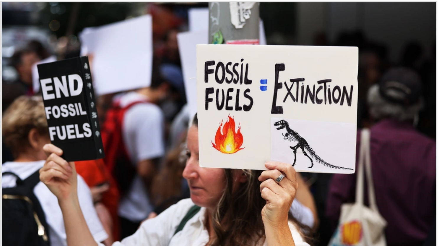
CLIMATE Thousands march in New York to demand that Biden 'end fossil fuels'