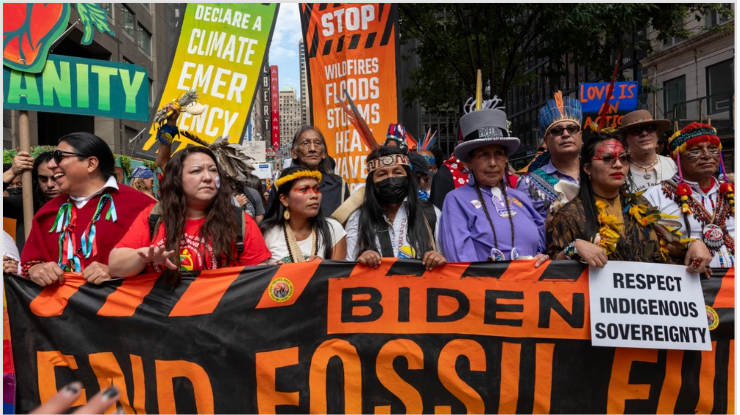
NEWS Up First briefing: U.N. and climate change; UAW strike Day 4; Barrymore pauses show