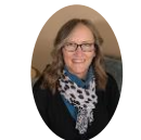
Dana Dahl Beach House Hotel