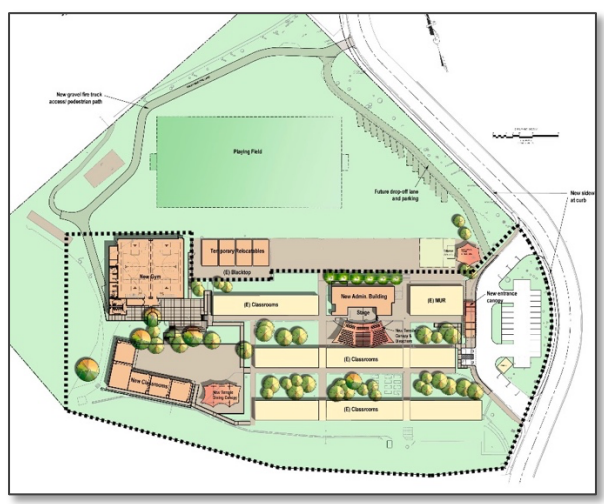
2013 Design as approved by the Planning Commission