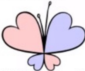
(U) CLogo a.k.a. "Child Lover"