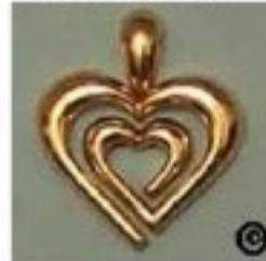
(U) GLogo Pendant

(U) The ChildLover logo (CLogo), as shown below, resembles a butterfly and represents non-preferential gender child abusers. The Childlove Online Media Activism Logo (CLOMAL), also represented below, is a general purpose logo used by individuals who use online media such as blogs and webcasts. 4