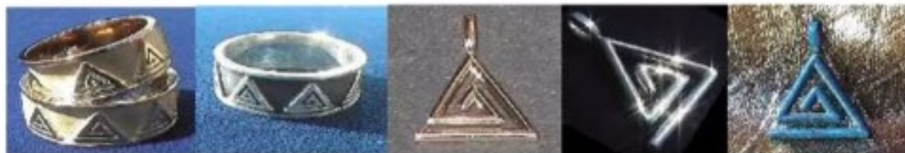
(U) BLogo jewelry