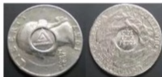
(U) BLogo imprinted on coins