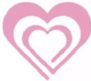
(U) GLogo a.k.a. "Girl Lover," Childlove