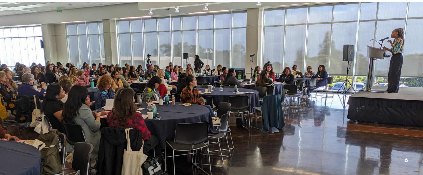
RISE 2024 Keynote Speaker Malia Cohen, CA State Controller

To gather comprehensive data, the Commission utilized a multi-faceted research approach of surveys, detailed interviews with key stakeholders (such as elected officials, organizations, child care providers, businesses, and early education leaders - all local), collaboration with local experts, analysis of existing research, and input from over 200 participants at the RISE Women's Leadership Conference, a community forum. This strategy enabled the collection of both quantitative data and qualitative insights, offering a well-rounded perspective on San Mateo County's economic equity landscape for women.