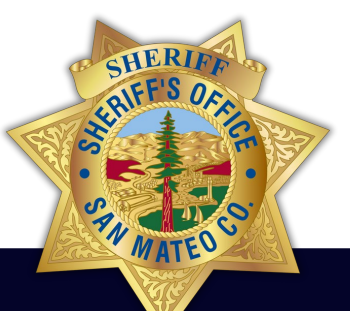
People First – Service Above Self