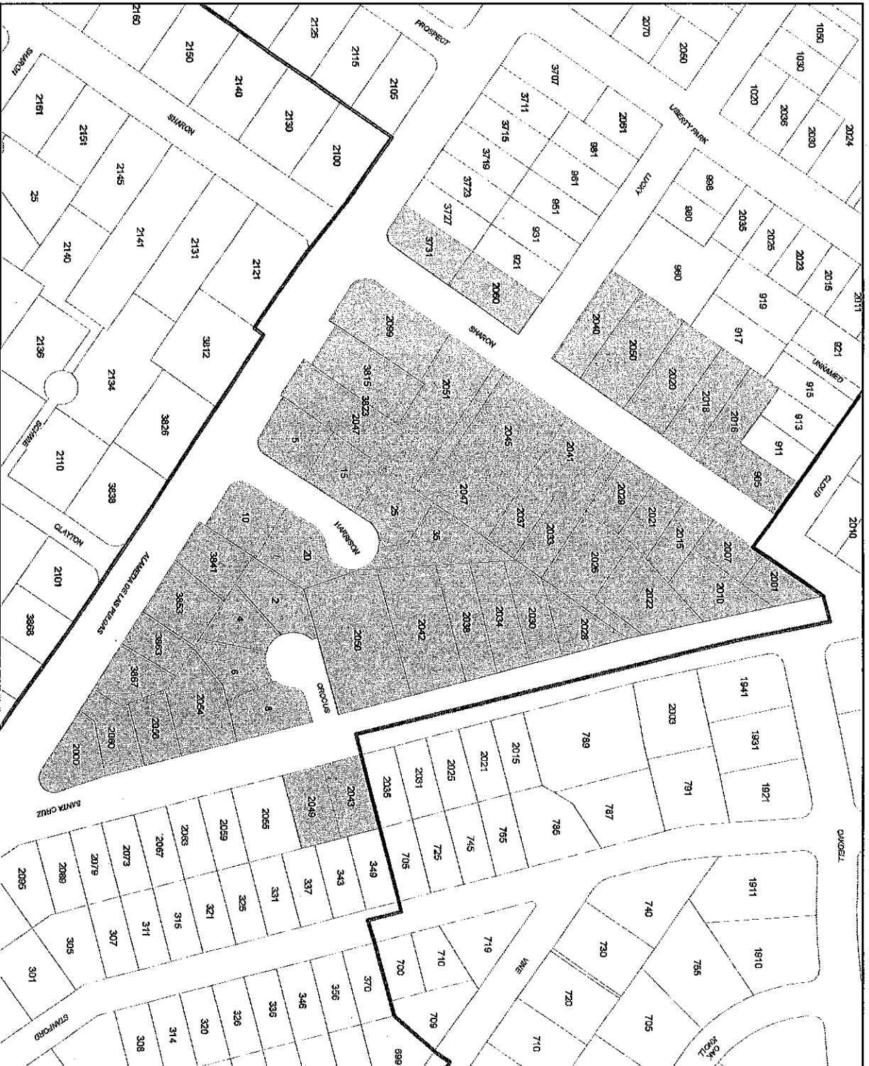
L:\Planning\GIS\Sites\West Menlo Triangle - 2015\West Menlo Park Triangle.mxd 5/12/2015 0a